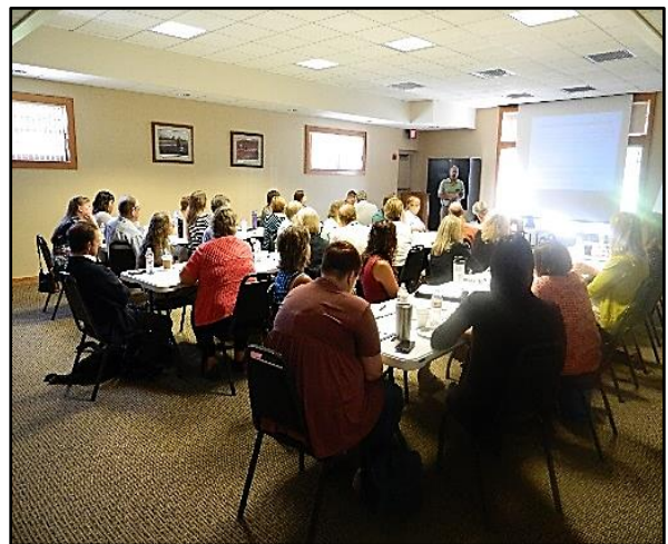
Public participation during the meeting.

It is important to point out that roadblocks to implementation of the strategies have been identified. For the strategies to be successful the roadblocks will have to be overcome. In numerous cases the roadblocks are not locally controlled, meaning that in order for local regional coordination to be truly successful rules, policies, and requirements of numerous non-regional entities will have to be modified or changed.