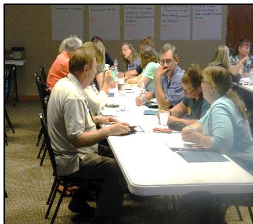
Break out session by Counties.

The second part of the meeting involved a break out session in which individuals were grouped by county. Each group discussed gaps and needs, prioritized plan goals and identified actions to meet the goals of the plan at the county level. At the conclusion of the meeting the regional and county public-transit human services transportation coordination plans were adopted/approved. The meeting record which summarizes the meeting activities is attached as Appendix B. Each of the meeting participants were also given meeting evaluation forms in an effort to evaluate the effectiveness of the meeting and planning process. In general, the evaluations were positive, and participants felt the meeting was productive. Appendix C attached contains a summary of meeting evaluation forms.