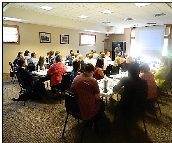
Public participation during the meeting.

It is important to point out that roadblocks to implementation of the strategies have been identified. For the strategies to be successful the roadblocks will have to be overcome. In numerous cases the roadblocks are not locally controlled, meaning that in order for local regional coordination to be truly successful rules, policies, and requirements of numerous non-regional entities will have to be modified or changed.