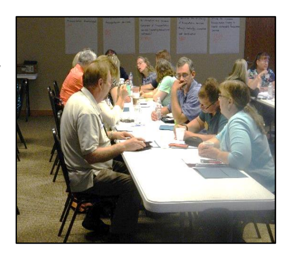
Break out session by Counties.

The second part of the meeting involved a break out session in which individuals were grouped by county. Each group discussed gaps and needs, prioritized plan goals and identified actions to meet the goals of the plan at the county level. At the conclusion of the meeting the regional and county public-transit human services transportation coordination plans were adopted/approved. The meeting record which summarizes the meeting activities is attached as Appendix B. Each of the meeting participants were also given meeting evaluation forms in an effort to evaluate the effectiveness of the meeting and planning process. In general, the evaluations were positive, and participants felt the meeting was productive. Appendix C attached contains a summary of meeting evaluation forms.