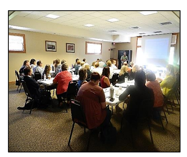
Public participation during the meeting.

The following five year "Regional Strategies, Activities and/or Projects Work Plan" was developed based on the Regional Transportation Coordinating Committees past efforts, public/participant input from the planning meeting conducted as part of the 2018 plan update, and information gathered from individual county "Strategies, Activities and/or Projects Work Plans" developed at the meeting. Both a Regional "Strategies, Activities and/or Projects Work Plan" and County "Strategies, Activities and/or Projects Work Plans" were prepared as part of the planning update process. The regional "Strategies, Activities and programs that when implemented will improve transportation coordination on a regional level looking across county lines and agency boundaries.