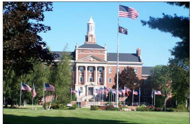
The Tomah VA Hospital not only provides medical services to veterans but also manages Fort McCoy's medical clinic

through which Tomah clinicians provide medical, psychiatric and dental services. Under one of these Veterans Administration - Department of Defense sharing agreements, the Tomah VAMC manages and operates the Troop Medical Clinic at Fort McCoy. They provide same day primary care services for soldiers for acute injuries and minor illnesses, and routine primary care appointments including dental. The Tomah VAMC also manages Fort McCoy's troop medical clinic including laboratory and imaging. As a result of these services the Tomah VAMC is an active participant in the Department of Defense's Tricare insurance plans. In addition, the Tomah VAMC works in concert with the Wisconsin Department of Veterans Affairs and the Department of the Army to create an innovative on site 70-bed Veterans Assistance Center for homeless veterans. Tomah VAMC also has sharing agreements for space and services with Tomah area hospitals, city recreation departments and other private sector institutions. Tomah VAMC is an active participant in CHAMPVA and the TRICARE Mental Health Contract.