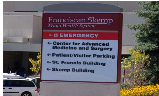
Being part of the Mayo Health System Franciscan Skemp can tap the resources of this highly regarded health care provider.

On July 1, 1995, three entities—Franciscan Health System, Mayo Foundation and Skemp Clinic, each with a long-tradition of services to the region came together to create Franciscan Skemp Healthcare. The hospital, located in La Crosse and initially known as St. Francis Hospital, opened its doors in 1883 and was the first hospital in western Wisconsin. Today Franciscan Skemp Healthcare includes approximately 185 physicians and PH.D.s, 53 associate providers and 3,000 allied health staff.