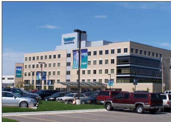
Gundersen Lutheran's recently completed $30 million Cancer Center

for primary and specialized care. Every year, Gundersen Lutheran has more than 1,300,000 outpatient visits and sees nearly 30,000 patients in its Trauma & Emergency Center.