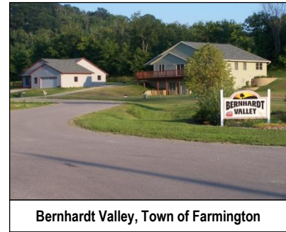
Bernhardt Valley, Town of Farmington

Housing in the MRRPC Region is typified by single-unit, detached houses; over two-thirds of all housing in the Region, and in every county except La Crosse County, fit this description in 2011 (see Table 2.5). A higher percentage (70%) of housing in the MRRPC Region is single-unit, detached, than in the state (66.0%) or the nation (60.3%). Buffalo County has the highest proportion (79%) of its housing as single-unit, detached, while La Crosse County has the lowest such proportion (61.5%), coming much closer to the national figure. Single-family, detached houses have long been the most-desired housing option for many Americans, and for decades, governmental housing policies have favored this type of housing over others. In fact, single-unit, detached housing grew as a percentage of all housing in the Region, State, and Nation between 2000 and 2011. However, a proliferation of single-family, detached housing can contribute to sprawl settlement patterns, especially large, single-story homes on large lots. It is a less efficient use of land than denser forms of housing, and poses some challenges in terms of upkeep and affordability for an aging population. Single-unit, detached housing is not necessarily owned by its occupant; many such houses are rented. However, since 81.9% of all owner-occupied housing is single-family, detached, we tend to think of home-ownership and single-family homes as synonymous.