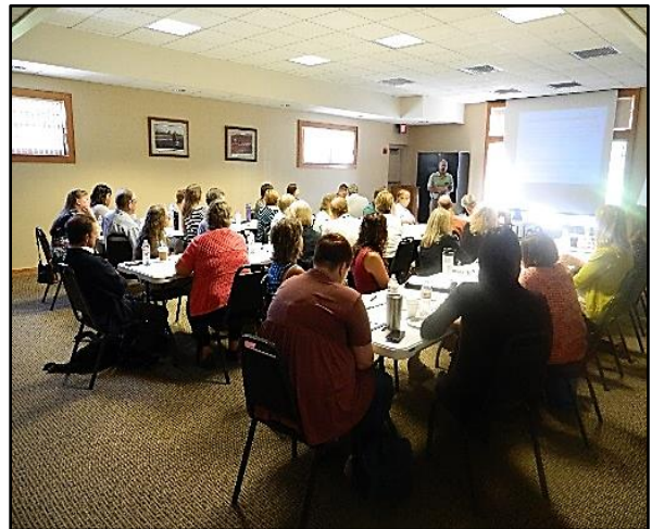
Public participation during the meeting.

The following five year “Regional Strategies, Activities and/or Projects Work Plan” was developed based on the Regional Transportation Coordinating Committees past efforts, public/participant input from the planning meeting conducted as part of the 2018 plan update, and information gathered from individual county “Strategies, Activities and/or Projects Work Plans” developed at the meeting. Both a Regional “Strategies, Activities and/or Projects Work Plan” and County “Strategies, Activities and/or Projects Work Plans” were prepared as part of the planning update process. The regional “Strategies, Activities and/or Projects Work Plan” focuses on activities and programs that when implemented will improve transportation coordination on a regional level looking across county lines and agency boundaries.