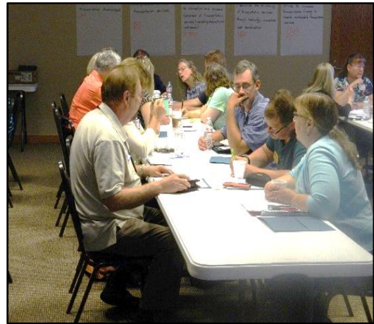
Break out session by Counties.

The second part of the meeting involved a break out session in which individuals were grouped by county. Each group discussed gaps and needs, prioritized plan goals and identified actions to meet the goals of the plan at the county level. At the conclusion of the meeting the regional and county public-transit human services transportation coordination plans were adopted/approved. The meeting record which summarizes the meeting activities is attached as Appendix B. Each of the meeting participants were also given meeting evaluation forms in an effort to evaluate the effectiveness of the meeting and planning process. In general, the evaluations were positive, and participants felt the meeting was productive. Appendix C attached contains a summary of meeting evaluation forms.